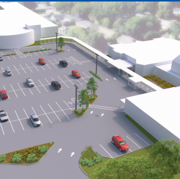
PAVE THE WAY PROJECT SUMMER 2016