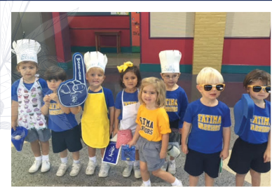
Fatima's newest addition The Pre-K 3 Program