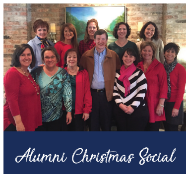
Alumni Christmas Social