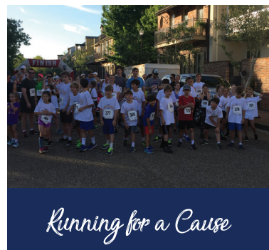
Running for a Cause