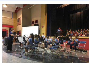
The school celebrated 100 years of the Fatima Apparitions with: